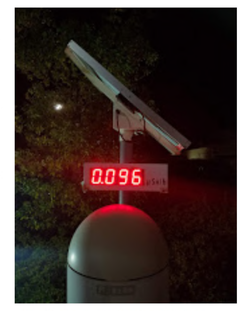
A radiation meter in Yumoto Area displaying microsieverts per hour

Iwaki city did a lot to check where radiation was - took the topsoil off of parks, implemented the monitoring systems. It's something we live with without even noticing anymore - and if you look at the actual numbers there's nothing to be concerned about.