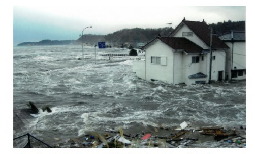
Onahama's Nagasaki District, March 11th

J: Although the initial order was for those within a 10km radius to stay indoors, my husband suggested do the same even though we were 50km away. Two days later, we packed up our car, and headed for my husband's family in Tottori. We took our most important possessions, thinking we might never come back - which turned out to be a reality for a lot of people. I really didn't want to leave, but because I had information coming in from NZ, and all the other factors had lined up, I thought "we have a chance". As a pregnant person, I also thought "I'm just a liability- the best thing I can do is not be here". Eventually we got to Tottori, and then we just had to sit on the sidelines and watch what was happening in Iwaki. I was really glad to hear that in my neighbourhood people were helping each other and sharing food and water. We saw the same thing the other year during the